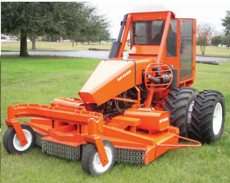
Optional enclosed cab includes A/C (Heat optional).